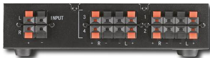
4PS Rear View