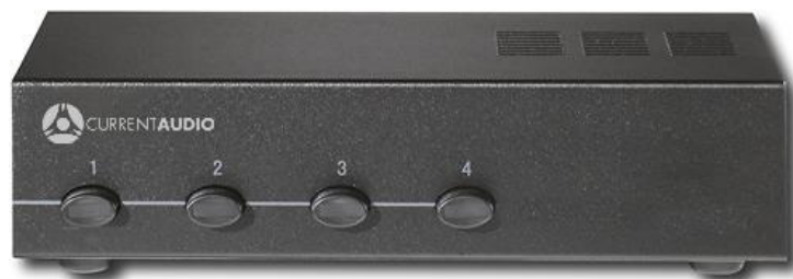
4PS Front View